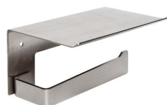
AI2003CS Satin finish