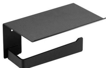
AI2003B Black finish