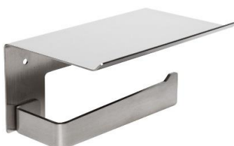
AI2003C Bright finish